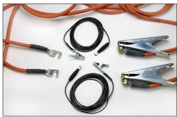
Cat. No. 1008-028