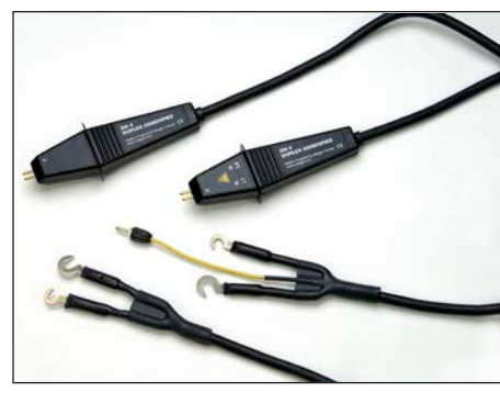
Cat. No. 1006-444 (DH4-C)