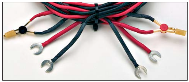
Cat. No. 241005-7