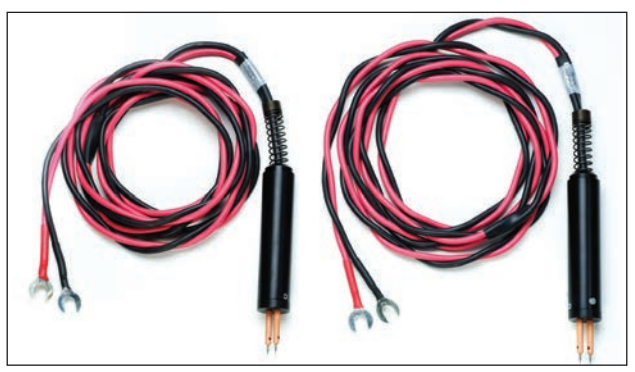
Cat. No. 242003-7