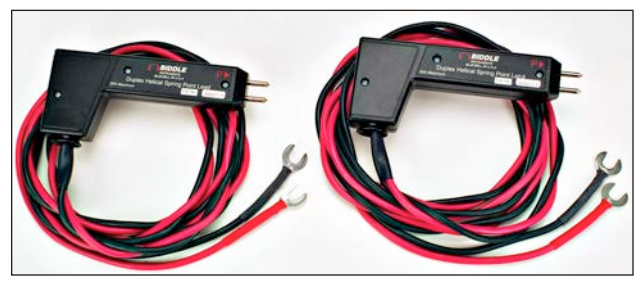
Cat. No. 242011-7