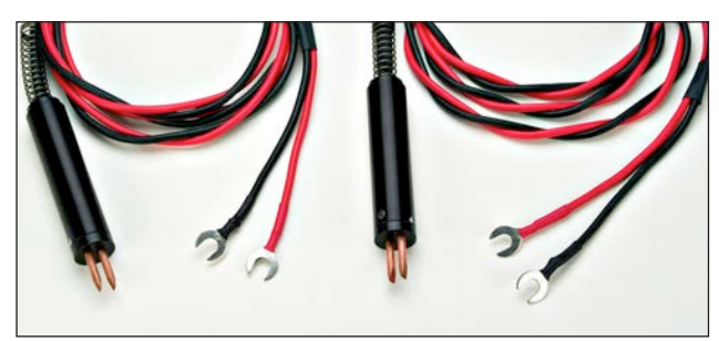
Cat. No. 242002-7